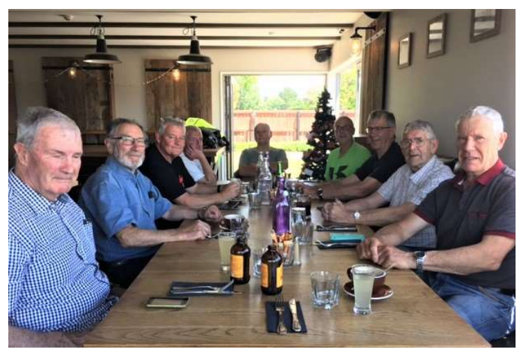
Lunch at The Hogget