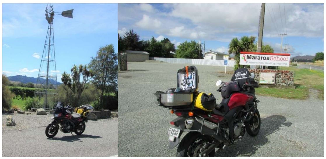
Waiau Valley windmill

<u>Things that stay the same</u>: During the planning stage I make up a prospective route, then modify, modify again, make up a completely new route, modify that, cancel the modification, make a new modification, cancel that route etc, etc, a few weeks go by, more routes, more modifications and I finally decide that what I came up with in the first place is the best idea anyway.