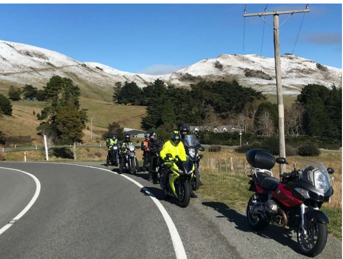
Near Hilltop enroute Duvauchelle Bay 10/08/22