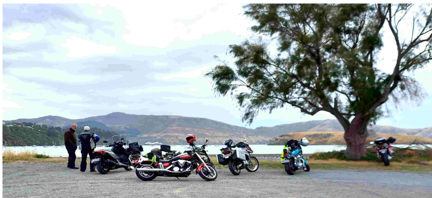
Lunch stop at Purau.