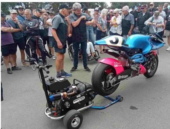
BEARS meeting Ruapuna Raceway 24/02/2024

We continued, passing the turn-off to Blackball (a trip for another day) and rode through part of the town of Greymouth to stop for fuel at Kumara. Not an easy task with the card system but welcome to those who would not have made it to Springfield. The weather that had been so good looked a bit doubtful however the light drizzle that developed soon petered out and allowed a quick ride to our last stop at Springfield. We shared the joy that the day had delivered and continued to Sheffield and separated for the ride home. Cheers and thanks to my fellow riders for a great ride.