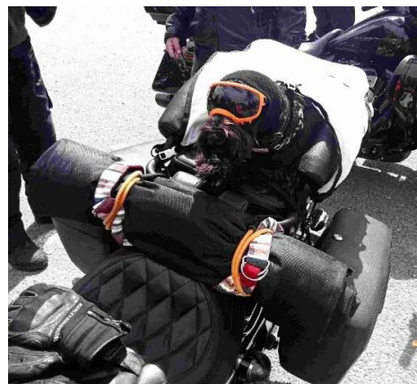
Dog with eye protection at Springs Junction