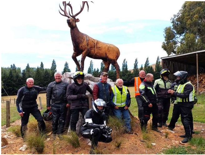
Waikari Valley Road Stag sculpture