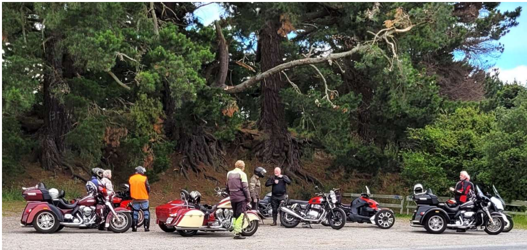
Regroup at the Waimak Gorge Bridge